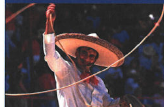
Enjoy the sights and sounds of San Antonio