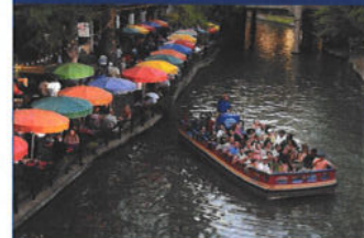
Relax on a cruise at the famous River Walk